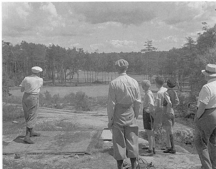
Utslag på Tylösands gamla 2:a.

Involved in over 30 golf projects throughout his career.